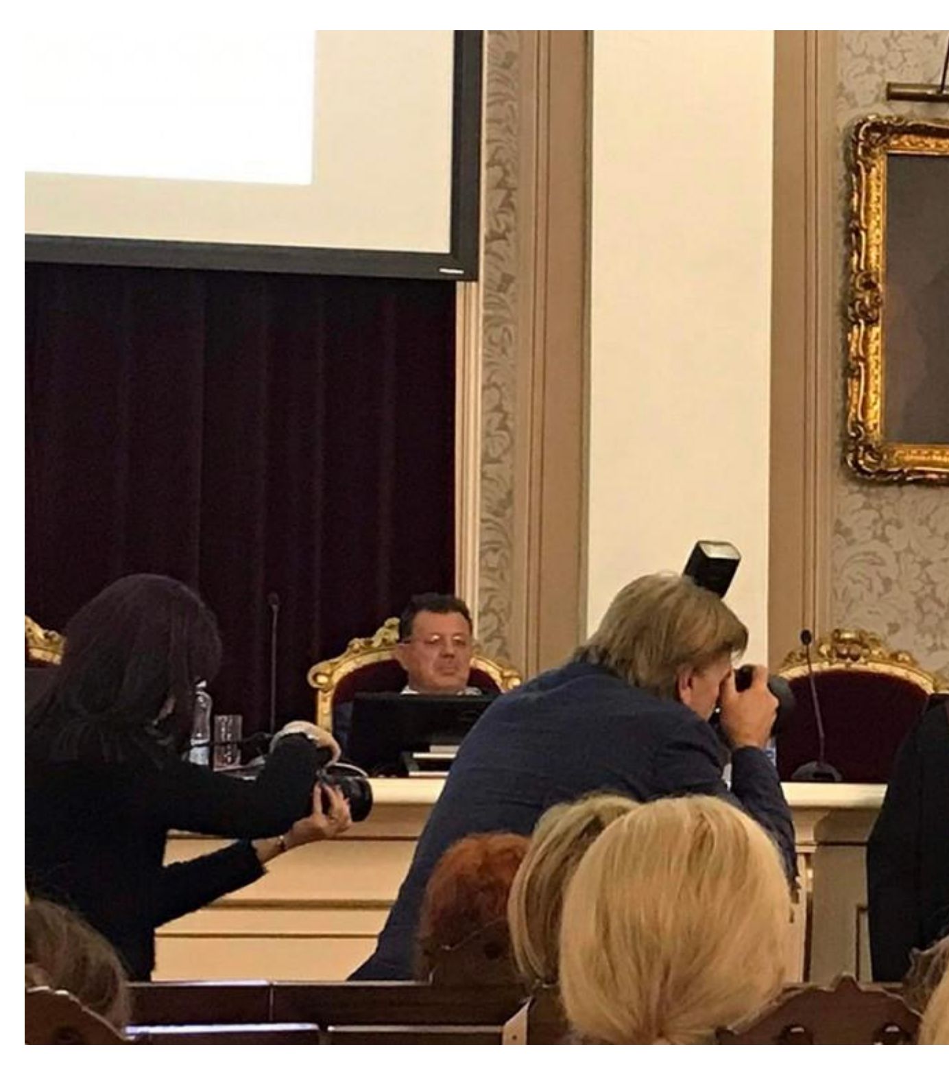
The awarding of this title is a further recognition of the Professor's work and contribution to Haematology-Oncology in particular and Medicine in general.